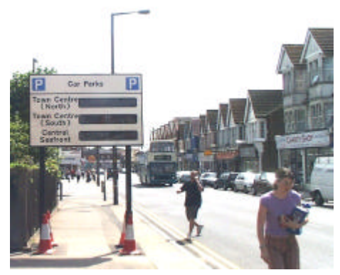
Variable Message Signs - will provide for the efficient management of traffic seeking available car parking spaces