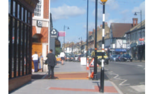
Footway improvements at the important shopping district of Leigh Broadway

The Borough Council is therefore requesting that the Government give consideration to an advancement and increase in Major Scheme funding. This will be essential if the Major Scheme and integrated projects are to proceed in a co-ordinated manner and the momentum now established of delivering quality integrated transport schemes on the ground is to be maintained. This will also be vital to the regeneration of Southend and the Thames Gateway as a whole – a national and regional priority for regeneration. A supplementary bid for resources from the surplus Dartford Tolling revenues has also been made to the Government as a possible way of funding the Major Scheme and other important transport schemes.