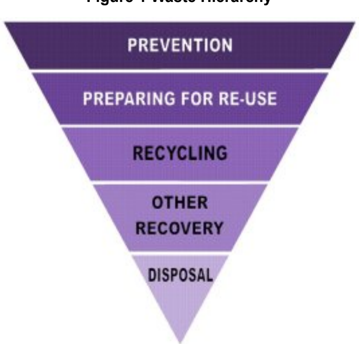
Figure 1 Waste Hierarchy