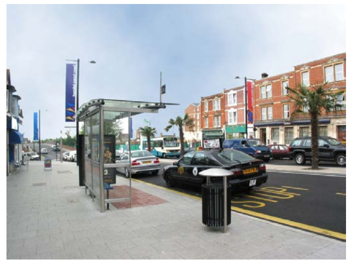
The Environmental Enhancement scheme at Hamlet Court Road has improved the public realm & regenerated the local area.