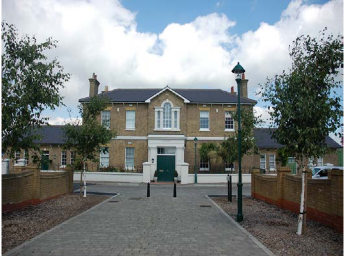
The buildings and street at North Camp Shoebury Garrison have been aligned with the Old Hospital building which has created a new visa through this part of the development.

62. Whenever possible existing historic landmark buildings should be protected and enhanced and strategic views preserved. Near and distant views both contribute to an areas character and should be respected where they occur. New development may also offer the possibility to open up views and