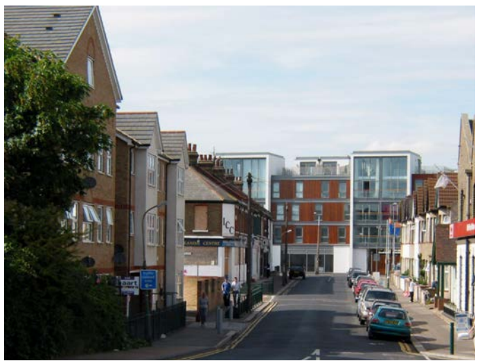
The Meridian Point in Southchurch Road development terminates the view from the railway bridge & provides enclosure to the streetscene.

67. New development should continue established street patterns where they are an integral part of local character, particularly building frontage lines which determine the proportions of the street. Buildings that are uncharacteristically set back or set forward from their neighbours often look out