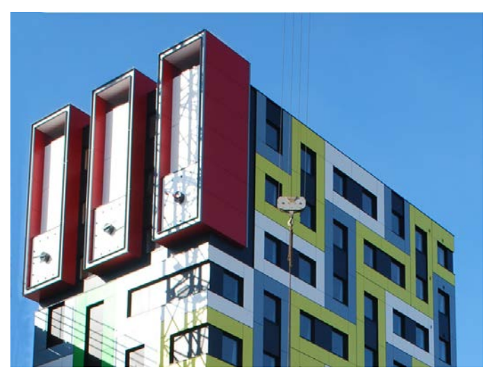
The public art element of the new college accommodation block is three clock faces that show the hours, minutes & seconds independently.

Further Information can be found in Appendix 9 Provision of Public Art as Part of New Development – Developer Guidelines and Southend's Public Art Strategy which sets out the procedures, maintenance