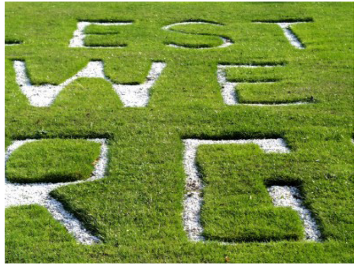
Even subtle interventions of public art such as the war memorial on the cliff top make a significant contribution to local distinctiveness.