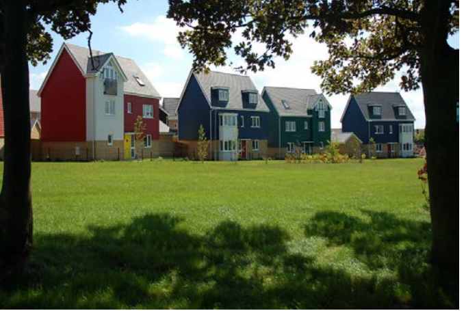
Development at Lifstans Way overlooks the newly created public open space which forms a focus for the development.

Policy Link - Core Strategy Policy CP4: The Environment and Urban Renaissance – 8, 10 Core Strategy Policy CP7 - Sport, Recreation and Green Space – 2 Saved BLP Policy C15 - Retention of Open Spaces Saved BLP Policy C13 - Street Furniture Saved BLP Policy H5 - Residential Design and Layout Considerations