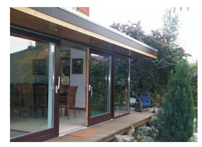
This custom designed conservatory is a significant asset to this property in Thorpe Bay.

Converting an existing garage to a habitable room may be one relatively easy option for extending a property but will not always be considered acceptable in principle. The viability of this option will depend on whether the parking space in the garage is required to meet the demand of the enlarged property and whether an acceptable design solution that successfully blends the converted garage with the rest of the dwelling can be found. Provided the loss of parking can be justified, a design that achieves a seamless integration with the existing house is