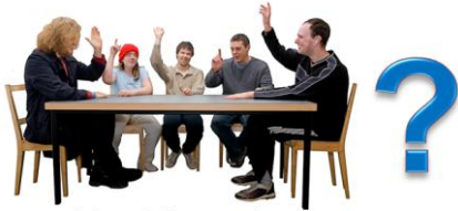
Health and Wellbeing Board