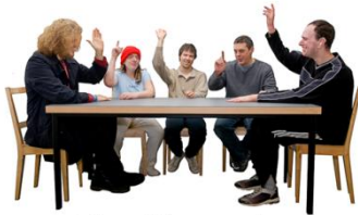
Health and Wellbeing Board

This leaflet is about the Health and Wellbeing Board . It will tell you some of the things it does.