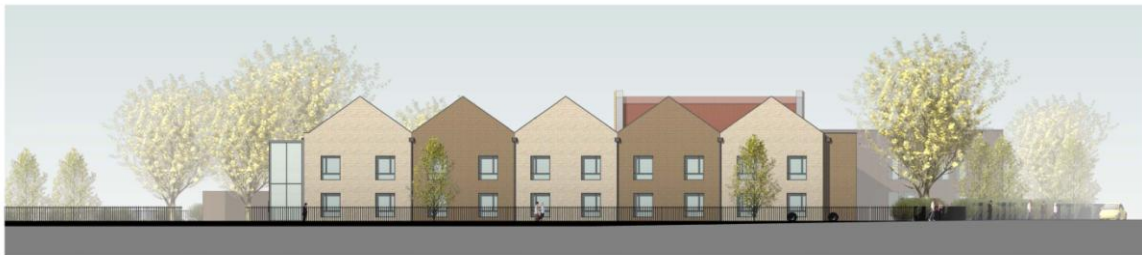
3 East Elevation to access road 1:200