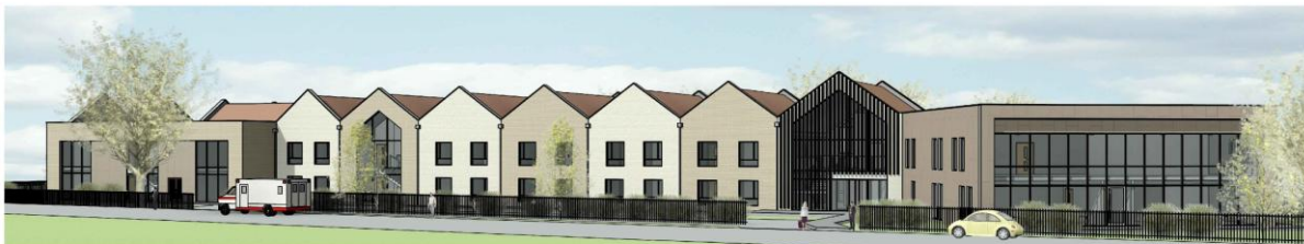
View from Burr Hill Chase looking south-east

MatthewCapener@southendcare.co.uk in the first instance. We will be consulting with residents, service users, carers and families as well as staff regarding the interior fit out of the homes including fittings, furniture and decoration, as well as outdoor landscaping.