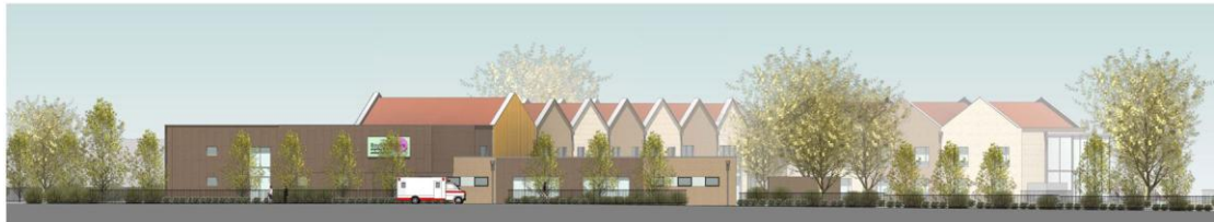
1 West Elevation to Prittlewell Chase 1:200