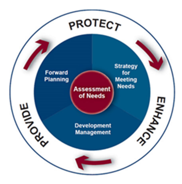
Figure 2.1: Sport England themes