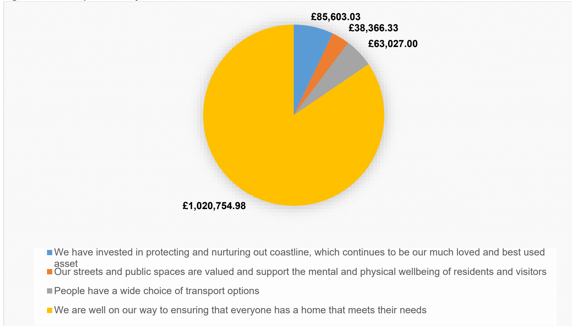
Figure 3 below indicates the expenditure of S.106 income spent by 2050 Outcomes.